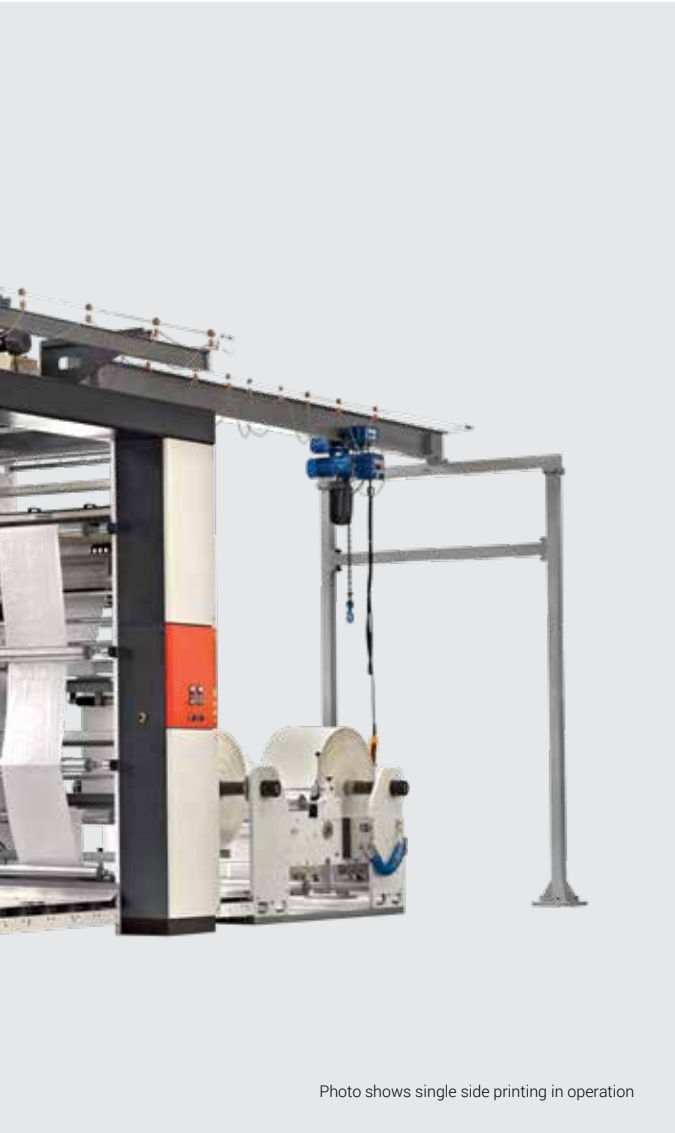
Photo shows single side printing in operation

Designed for high quality 4/6 colour flexographic printing on flat/ tubular PP/HDPE woven fabric